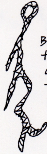
Join Branches to create a long tap Root